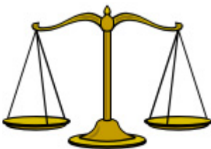
SCALES OF JUSTICE

God acquits us from the Courtroom of Eternal Justice on the grounds that Jesus Christ paid our fine. We are “justified” (made right with God) by His suffering death. The resurrection of Jesus Christ was God's seal of approval of the fact that His precious blood was sufficient to pay the fine.