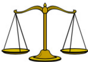
SCALES OF JUSTICE

God acquits us from the Courtroom of Eternal Justice on the grounds that Jesus Christ paid our fine. We are “justified” (made right with God) by His suffering death. The resurrection of Jesus Christ was God's seal of approval of the fact that His precious blood was sufficient to pay the fine.